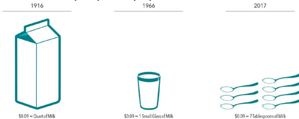
Exhibit 1. Your Money Today Will Likely Buy Less Tomorrow

This erosion of the real purchasing power of wealth is called inflation. Inflation is an important element of investing. In many cases, the reason for saving today is to support future spending. Therefore, keeping pace with inflation is a crucial goal for many investors. To help understand inflation's impact on purchasing power, consider the following illustration of the effects of inflation over time. In 1916, nine cents would buy a quart of milk. Fifty years later, nine cents would only buy a small glass of milk. And more than 100 years later, nine cents would only buy about seven tablespoons of milk. How can investors potentially prevent this loss of purchasing power from inflation over time?